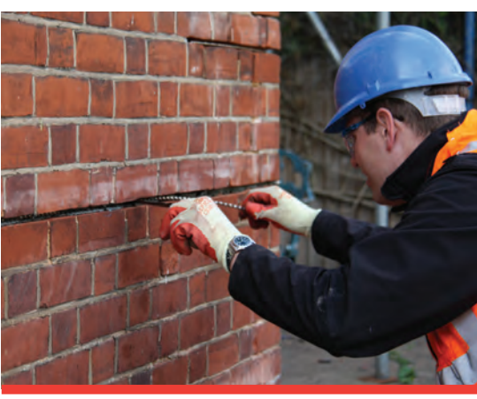
HeliBar is inserted into HeliBond grout within a cut slot